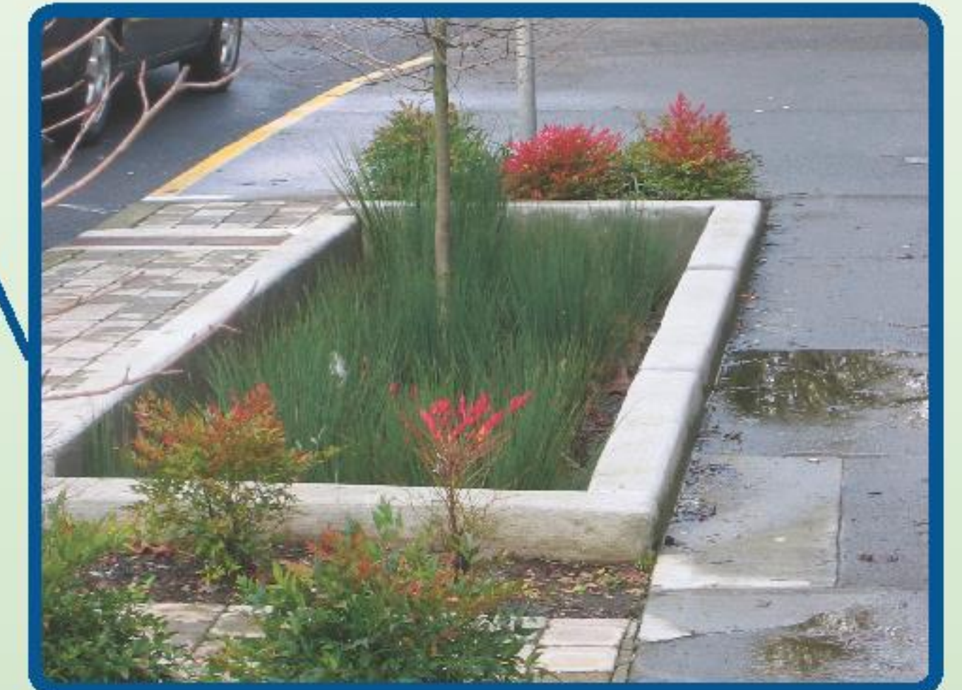
Tree Planter Box